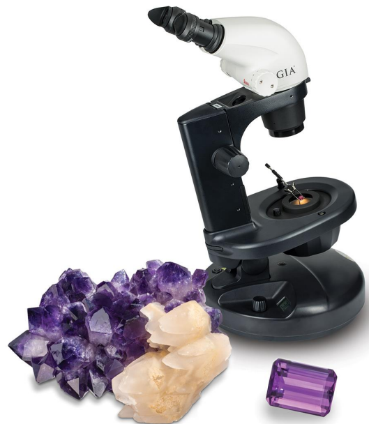
GIA DLScope Professional with rough and polished amethyst